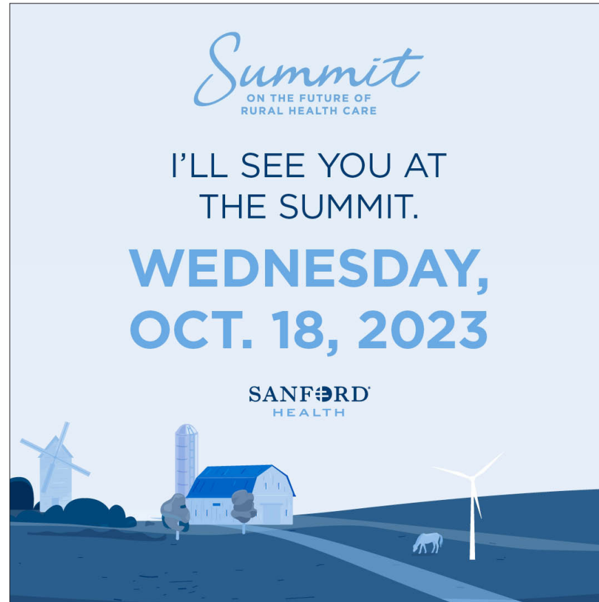
Aprimo Document Number: 813-589-963 Size: 1080x1080